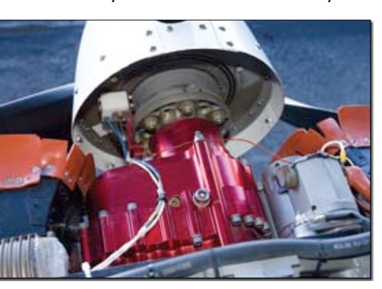
The Generation 3 PSRU, like its predecessors, is a two-shaft, four-gear arrangement meant to put the prop shaft on the same plane as the crankshaft.

The complicated panel and the significant differences in electronic considerations for an automotive engine conversion required that every decision made and every wire that we connected be carefully documented. I looked at several different types of CAD and electronic design programs, but ended up using a simple drawing program, Smart Draw, which offered more flexibility and a shorter learning curve. Every day that Pete and I spent working on the panel or wiring, I would take home our pencil sketches made on legal pads or scrap paper and convert them to schematics and electronic drawings that were carefully archived both electronically and