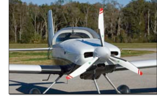
One benefit of using a modified standard RV-7A cowling is that the airplane's sleek lines remain largely undisturbed. That's to say she's still a looker.

In March of 2007 we cranked up the Subaru engine for the first time and were pleased with how quietly and smoothly it ran. Some hard-starting issues were quickly solved after reviewing the wiring with Jan, and soon we were ready for a formal weight and balance. While