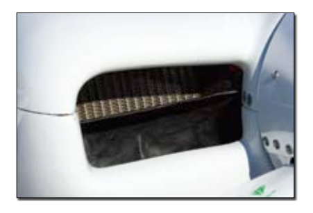
The horizontal duct borrows intake air from the copilot-side radiator and takes it back to the oil cooler. Precisely sizing and placing this splitter required many hours of trial-and-error testing.