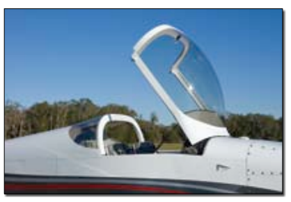
We are not getting drawn into the tip-up versus slider discussions. Not, not, not...

It's fair to say that more of the development process took place in my hands than I had ever expected or wanted. So, the big question: Would I do it again? No. Am I satisfied with the finished product today? Yes. But you might want to ask me again in a few years when the longevity of this "firewall-forward" package is proven. \pm