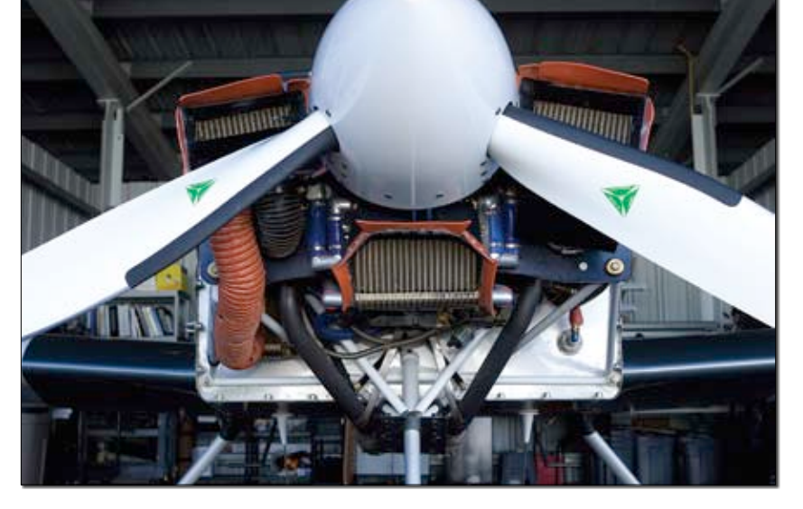
The modified water cooling system employs three small radiators around the prop; the current configuration has two larger radiators left and right of the PSRU.

in a series of notebooks for future reference. This slightly obsessive behavior proved its worth time and again as the project's timeline lengthened, and we would revisit a long-finished module to add to it or modify it as we came closer to completion.