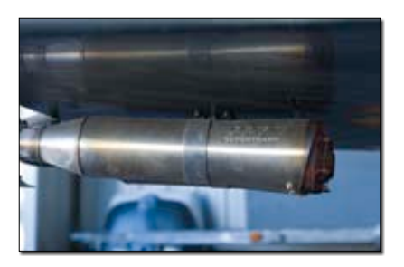
Twin SuperTrapp mufflers quiet the normally raucous H6 Subaru.

The winter of 2004 was spent making minor modifications and "improvements" to the airframe. These varied from a stiffener for the armrest to an automotive-type fuel screen in the wing tanks to replace the original primitive pickup. Each of these departures from the tried and true required careful thought and consideration, and each meant ounces that would add up, as I would ruefully discover with our first weight and balance two years later. The panel underwent another round of revisions, and we kept pulling wires. There seemed an endless number of complex and layered electrical connections that needed to be made, and my father, who