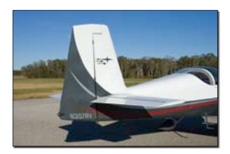
A subtle clue to the RV-7A's powerplant: the Subaru field of stars.