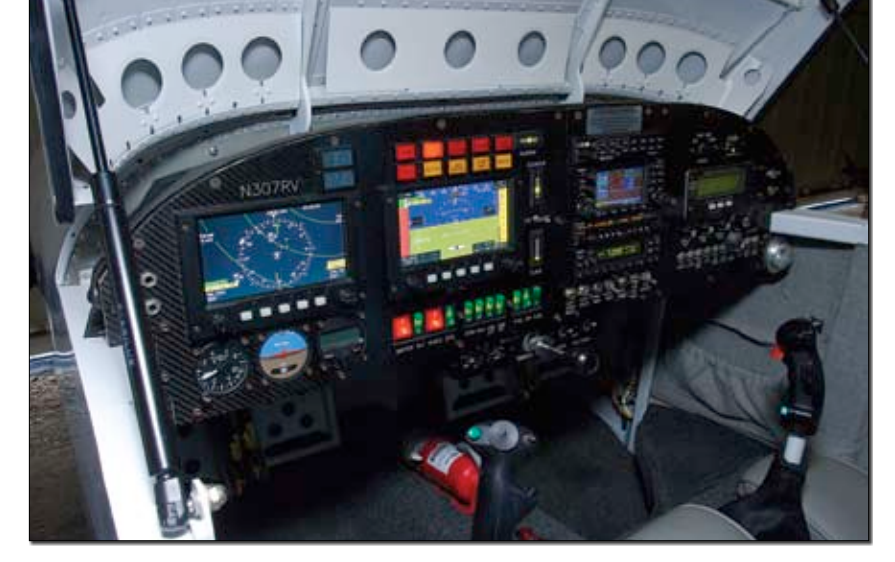
Twin Grand Rapids Horizon One EFIS displays are the centerpiece of Simpson's high-end panel. The data-logging capabilities of the system have been a huge help in refining the airplane.

enfellner's recommended limitations, but was unable to identify what it was about my particular installation that might have resulted in these higherthan-expected operating temperatures. A third generation (Gen 3) PSRU had been introduced with the second batch of H6 engines, offering a 2.02 engineto-prop ratio (compared to 1.82 in the Gen 2) and was initially available as a