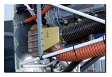
Simpson's "homebrew" oil-cooler arrangement uses 3-inch ducts taken off the forward air intake.

The first H6 builders to fly with the rear-mounted oil coolers shared their experiences and were struggling to find a way to keep the oil temperatures out of the red. I decided to place my oil cooler on the right side of the engine to make changing the left-sided oil filter easier. I